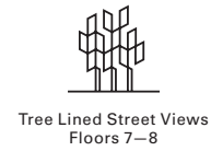
Tree Lined Street Views Floors 7-8

The complete offering terms are in an offering plan available from the Sponsor: Cadman Associates LLC. File No. CD18-0010. All dimensions are approximate and subject to normal construction variances and tolerances. Gross square footage exceeds the usable floor area. Sponsor reserves the right to make changes in accordance with the terms of the Offering Plan. Plans and dimensions may contain minor variations from floor to floor. Equal Housing Opportunity.